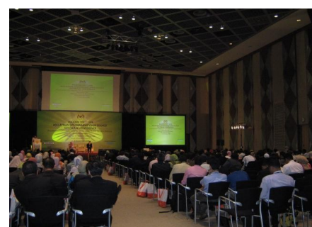
Participants of MyGOSSCON 08

This conference will highlight various aspects of open source software, including its widespread global applications and manifold benefits to dispel myths and misconceptions that exist about it. In addition to this OSS showcase exhibition, the conference will also feature a Code Sprint challenge and an awards ceremony for the best OSS Case Studies by