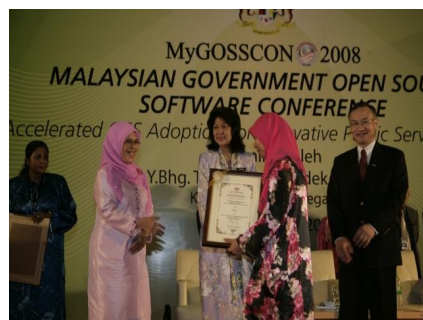
OSS Case Study Awards

Leading by example, GOM continues to spearhead a paradigm shift for the local ICT Industry which is reflected by a more integrated and improved Public Sector Delivery System and a strong business proposition with value and knowledge based user groups.