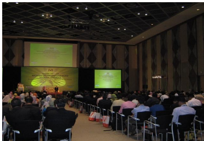
Participants of MyGOSSCON 2008 at Putrajaya International Convention Centre